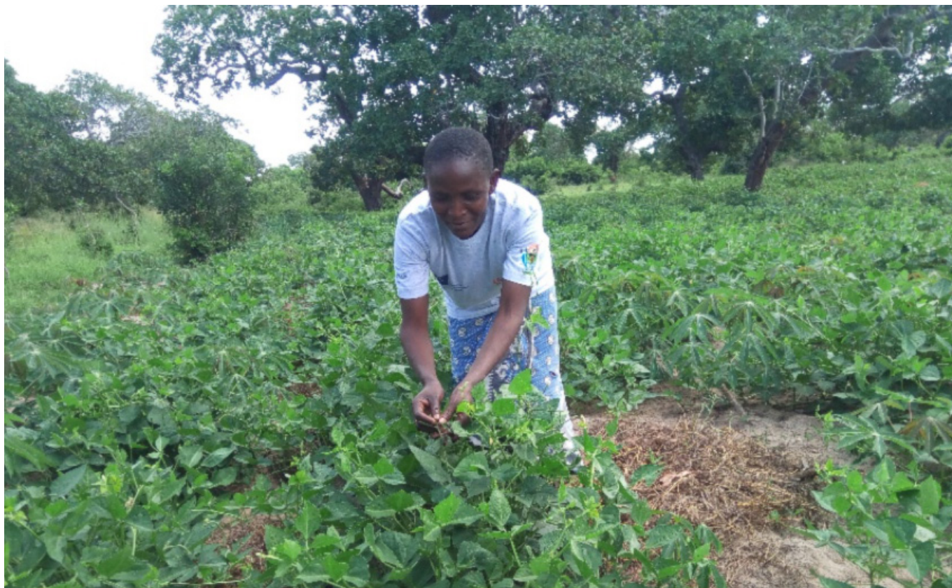
Lead Farmer of Amani Mama Growers checking leaves of the cassava grown for any infection or infestation.

plant possesses several growth parameters and physiological processes which can be used to measure its ability to produce adequate yield under various abiotic and biotic stresses.