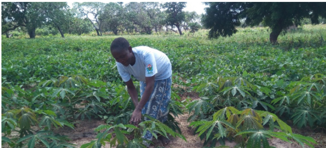
Lead Farmer of Amani Mama Growers Group at the learning site of Amani Mama – Baguo doing general monitoring of the crops grown such as cassava, green grams and cowpeas.

Cassava is known to produce about 10 times more carbohydrates than most cereals per unit area, and is ideal for production in marginal and drought prone areas, which comprise over 80% of Kenya’s land mass. A cassava